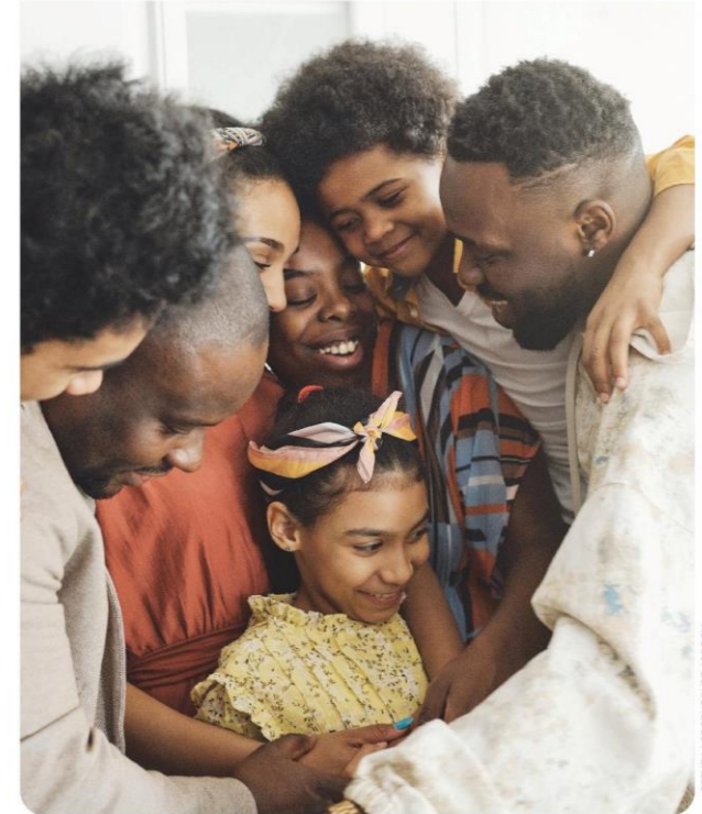
ANASTAS DE RICHELIEU/REXELS